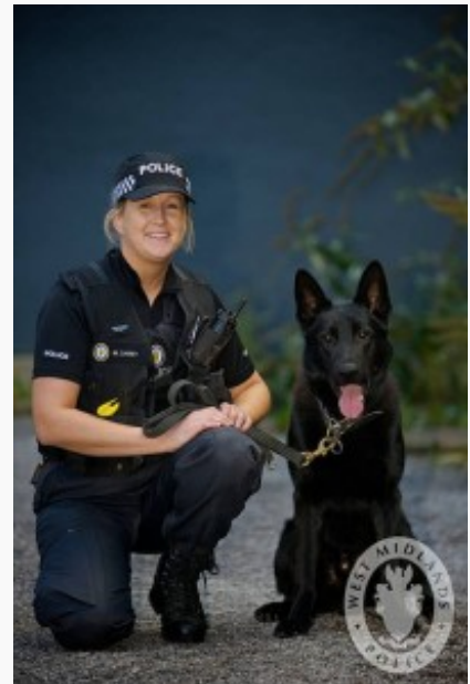
Do you need a pro tracker to Track Insider Transactions? | Flickr: West Midlands Police

In the field, enter COMPANY-NAME="apple" and search.